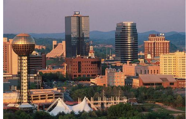
Downtown Knoxville, Tennessee

As we all continue our individual, community, state, and national fights for liberty, encountering differences and conflict along the way, let us all keep this story and our ultimate goal in mind. We are all on the same team and we shall persevere. We just need to KEEP GOING! ❖